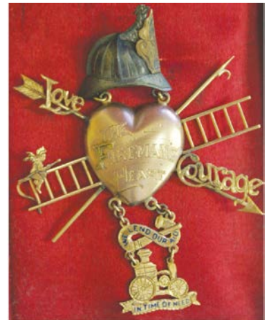
1894 Fireman's Heart Medal