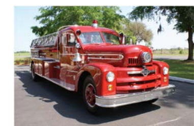
1955 Seagrave Ladder Truck

Today, just as in past years, the men and women of Ocala Fire Rescue are committed to saving lives and protecting property.