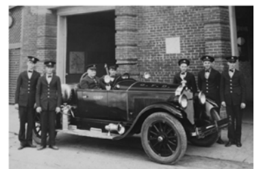
1915 First Motorized Apparatus