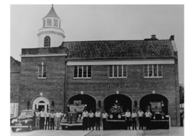
1941 Addition to Fire Station