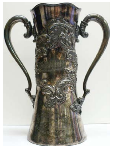
1894 Silver Presentation Cup