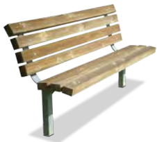
With Back $300