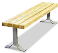
Backless Bench $200